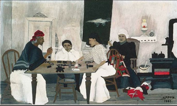
Domino Players , 1943 Oil on composition board, 12 3/4 x 22 in. The Phillips Collection