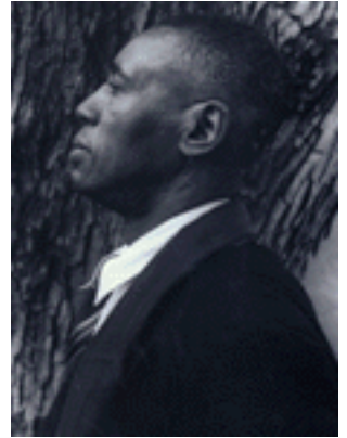
Photograph of Horace Pippin

Born West Chester, Pennsylvania 1888; died West Chester 1946 Horace Pippin was an African American painter. He was born around 1888—just twenty-three years after the Civil War and the end of slavery. His grandparents were slaves, and his parents were domestic workers. Pippin enjoyed drawing and illustrated his spelling words in school. His family could not afford art materials. At age ten, he won a box of crayons in a magazine-drawing contest and started coloring. He left school at age fourteen to help his family. He worked on a farm, as a porter at a hotel, and as an iron molder in a factory.